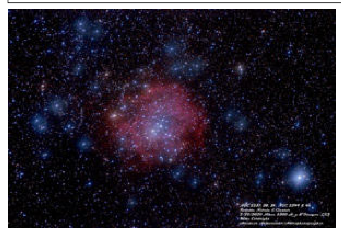
Please see our website for more of Mike's work. <a href="https://www.holland-saaa.org/">https://www.holland-saaa.org/</a>

I am again upstaged by my namesake, (and not for the first time, nor the last) I have a little noticed companion, (we are a study in contract). "Cor Scorpionis", (so I was known in the past). Which star am I?